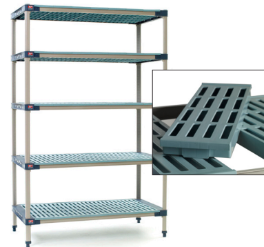
Five Tier Starter Unit